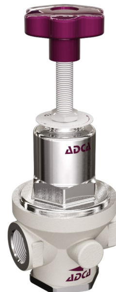
PS30SS 1/2" – DN 15

Type of fluid. Maximum operating temperature. Required opening pressure capacity (maximum and minimum).